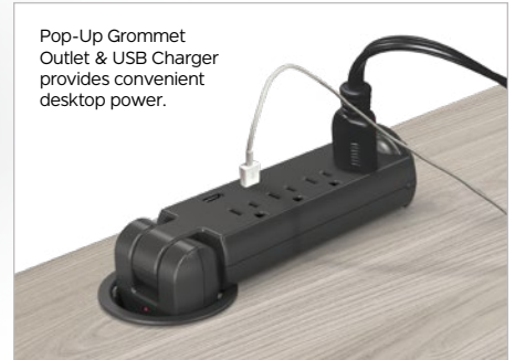
Pop-Up Grommet Outlet & USB Charger provides convenient desktop power.