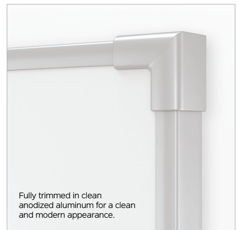
Fully trimmed in clean anodized aluminum for a clean and modern appearance.