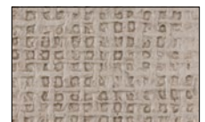
Gray Vinyl 44