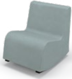
Soft Sway (Small) 7000RC-VX