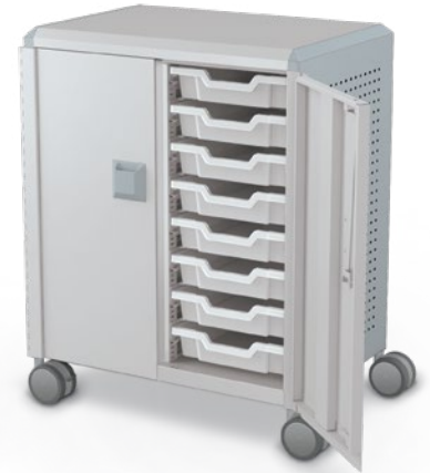
Double cabinet workstation

Choose your cabinet style and we'll do the rest!