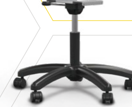
5-Star Base (hard or soft caster)