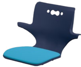
Arms + Upholstered Seat