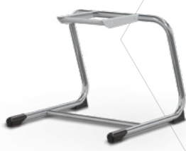
Cantilever Base Chrome