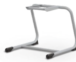
Cantilever Base Platinum