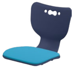
No Arms + Upholstered Seat