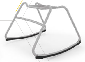
Rocker Base Platinum