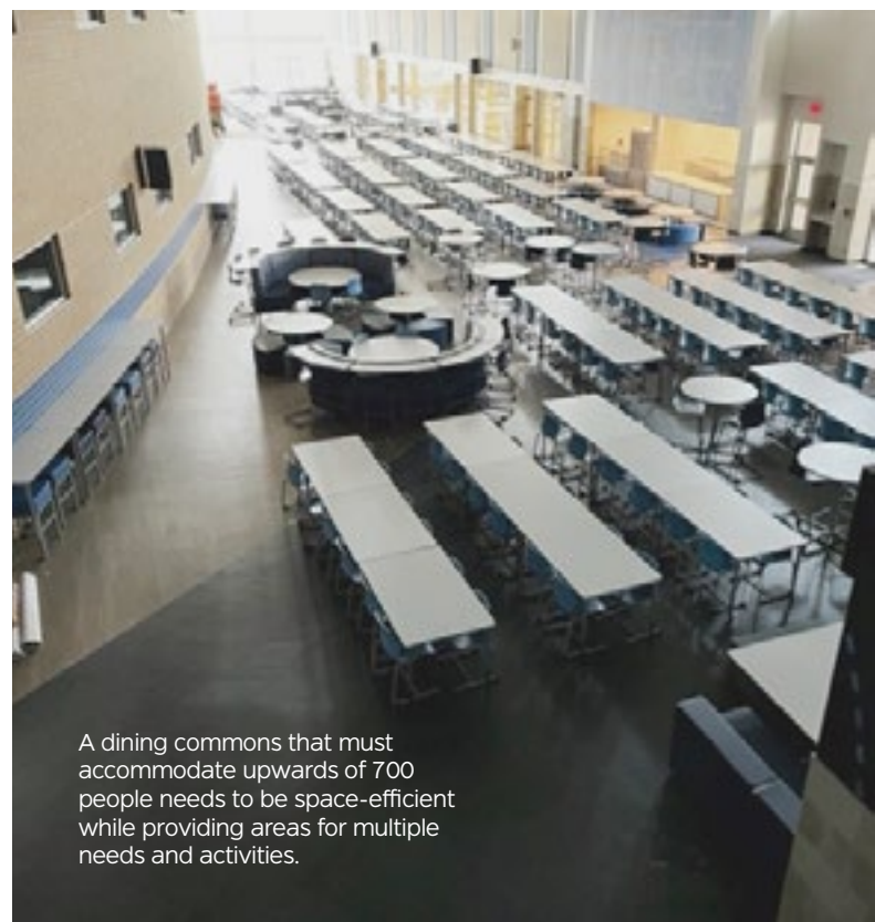
A dining commons that must accommodate upwards of 700 people needs to be space-efficient while providing areas for multiple needs and activities.