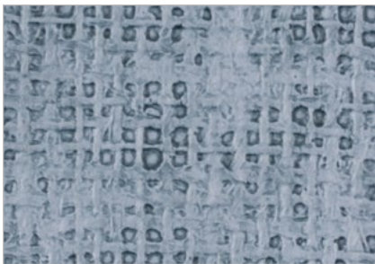
Pacific Blue 47