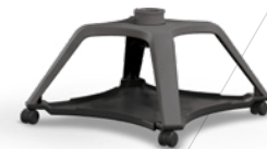
Enroll Base (hard or soft caster)