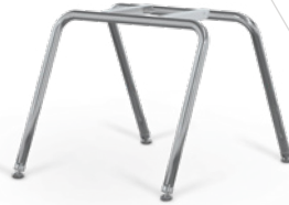
4-Leg Base Chrome