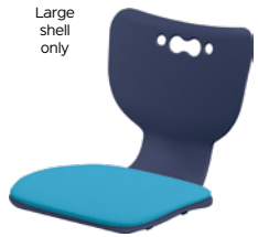
No Arms + Upholstered Seat