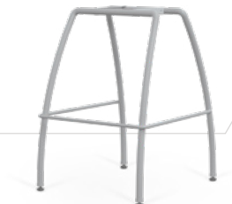
4-Leg Stool Base Platinum