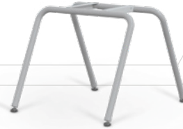
4-Leg Base Platinum