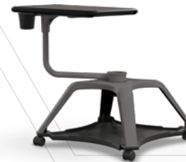
Enroll Base + Tablet Arm & Cup Holder (hard or soft caster)