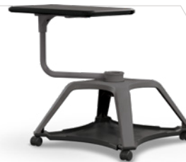
Enroll Base + Tablet Arm (hard or soft caster)