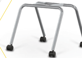
4-Leg Caster Base Chrome (hard or soft caster)