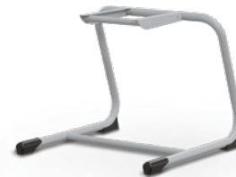
Cantilever Base Platinum