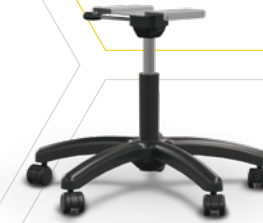
5-Star Base (hard or soft caster)