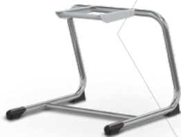
Cantilever Base Chrome