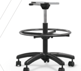
5-Star Stool Base (hard or soft caster)