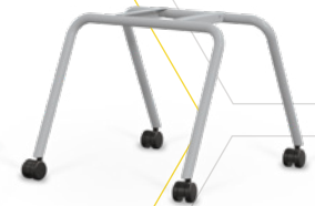
4-Leg Caster Base Platinum (hard or soft caster)