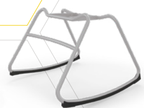
Rocker Base Platinum