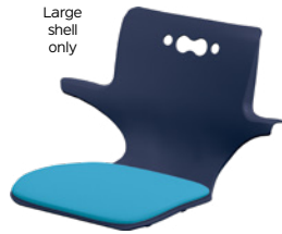
Arms + Upholstered Seat