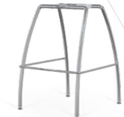
4-Leg Stool Base Chrome