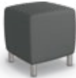
Square Stool – Medium 990M