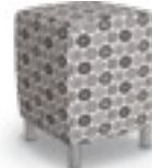
Square Stool – High 990H