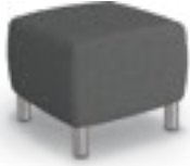
Square Stool – Low 990L