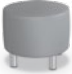
Round Stool – Low 980L