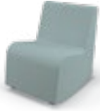
Soft Sway (Large) 1000RC-VX