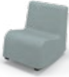
Soft Sway (Small) 7000RC-VX