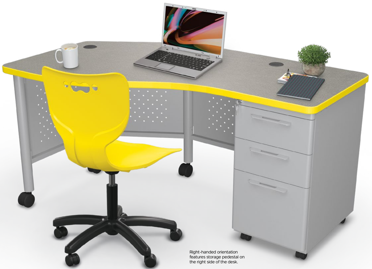
Right-handed orientation features storage pedestal on the right side of the desk.