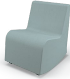
Soft Sway (Large) 1000RC-VX