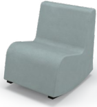
Soft Sway (Small) 7000RC-VX