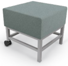
Mobile Counter Stool (18"H) 945