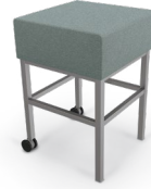
Mobile Bar Stool (30"H) 950