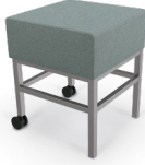
Mobile Counter Stool (24"H) 940