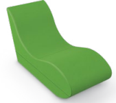
Relax Junior FM3RJR1