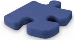
Puzzle Piece Edge Floor Pad FM2EGP2