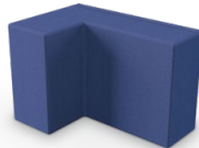
Comfy Block L FM3CBL1