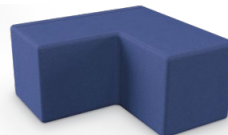
Comfy Block V FM3CBV1