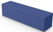
Comfy Block I FM3CBI1