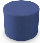
Dot Ottoman FM2DOT1