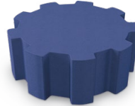
Wheel Ottoman (Large) FM2LGW1