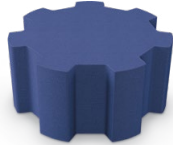
Wheel Ottoman (Medium) FM2MDW1