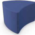
Chevron Ottoman FM2CHV1