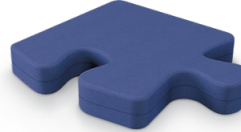
Puzzle Piece Corner Floor Pad FM2CNP2