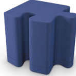
Puzzle Piece Corner Ottoman FM2CNP1