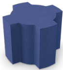
Wheel Ottoman (Small) FM2SMW1