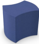
Quad Ottoman FM2QUD1