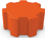
Wheel Ottoman (Medium) FM2MDW1