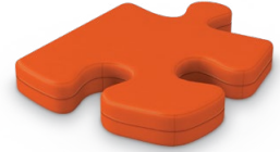
Puzzle Piece Edge Floor Pad FM2EGP2