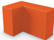
Comfy Block L FM3CBL1