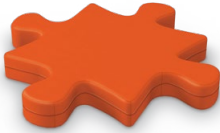
Puzzle Piece Middle Floor Pad FM2MDP2