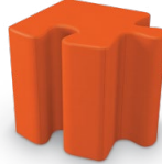
Puzzle Piece Corner Ottoman FM2CNP1