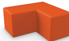
Comfy Block V FM3CBV1