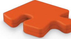
Puzzle Piece Corner Floor Pad FM2CNP2