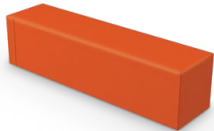
Comfy Block I FM3CB11