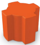
Wheel Ottoman (Small) FM2SMW1