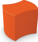
Quad Ottoman FM2QUD1