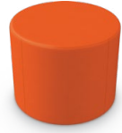
Dot Ottoman FM2DOT1