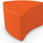
Chevron Ottoman FM2CHV1